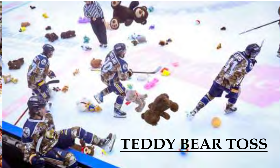
TEDDY BEAR TOSS